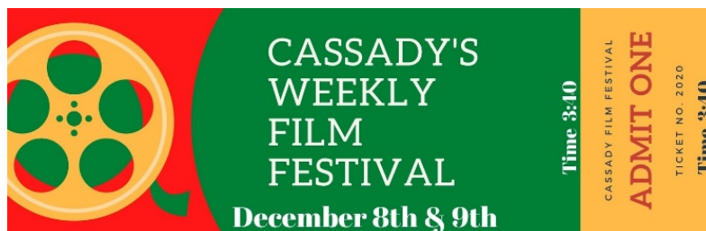
Movie ticket: Made on Canva (just change dates accordingly)