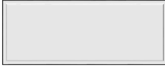
Chart D – Extension Activity for early finishers