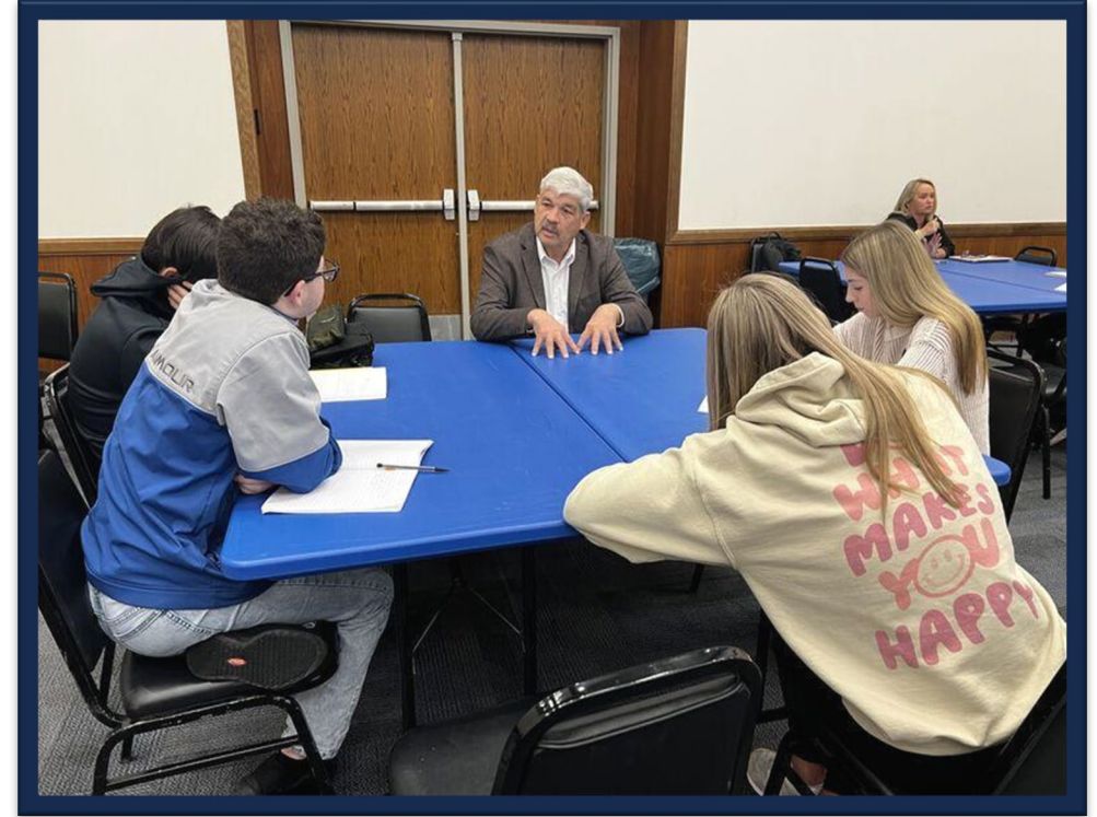
Rowan County Senior High School students conduct round-table discussions with community members hosted on Morehead State University's campus.